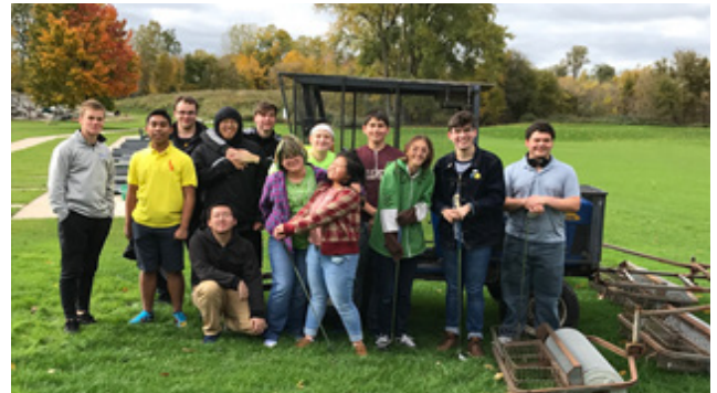
They also went to Pamperin Park to Frolf or Fish!